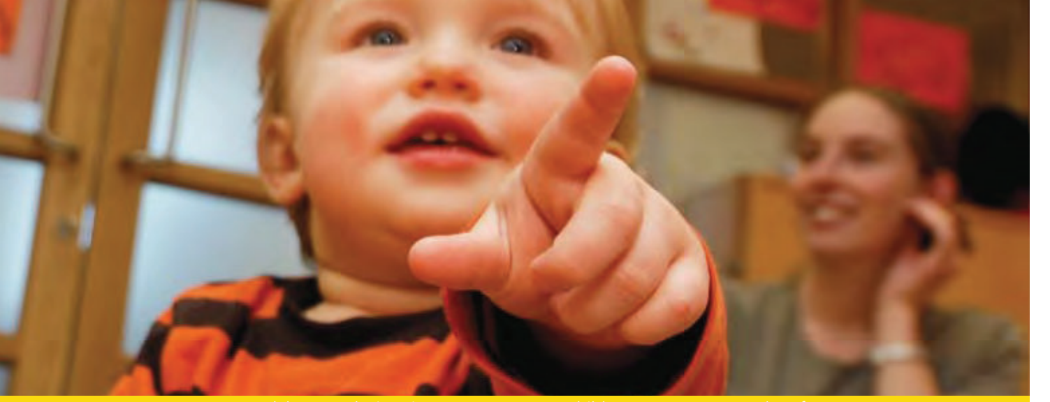
Roundabout and City View East Sure Start Children's Centres Annual Performance Report 2008/09